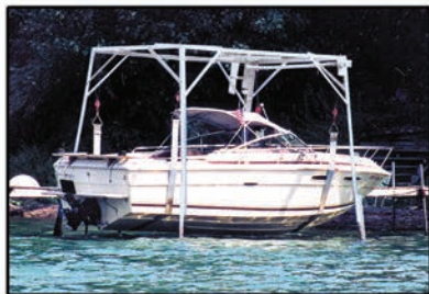
IB4500E Overhead Lift with Adjustable Slings